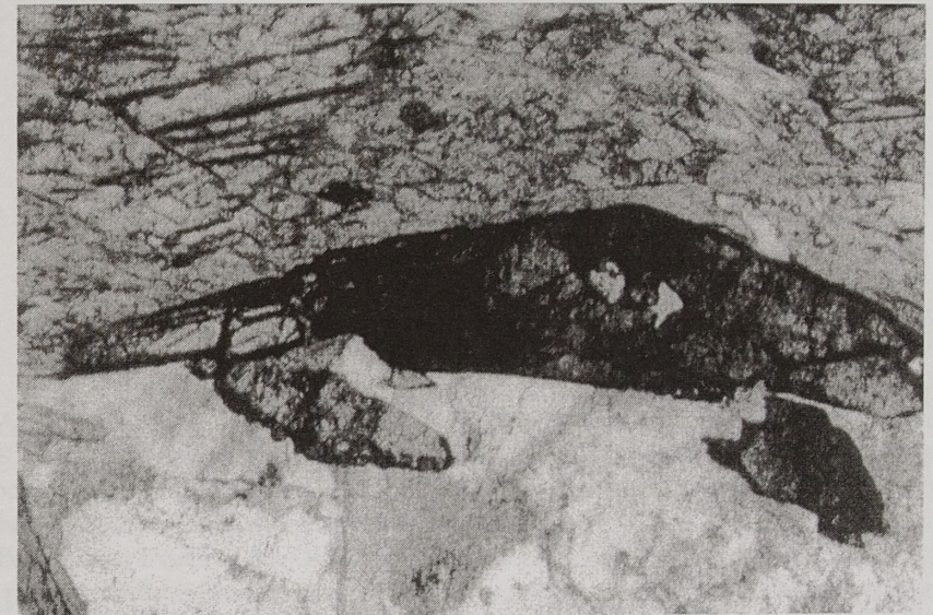
Phot. 1. Subhedral sphene crystals between hornblende (darker) and feldspars. Plane polarized light, magn. 100×

W pracy przedstawiono rezultat datowania próbki hornblendy wyseparowanej z żyły pegmatytu przecinającego monzodioryt kwarcowy w kamieniołomie w Przedborowej. Analizowana próbka była ręcznie wybierana pod lupą binokularną, a jej czystość sprawdzono przez obserwacje mikroskopowe preparatu proszkowego oraz analizą spektroskopową w podczerwieni. Uzyskany rezultat ( 335.5 \pm 5.0 mln lat) jest zgodny z innymi publikowanymi danymi na temat wieku skał magmowych strefy Niemczy.